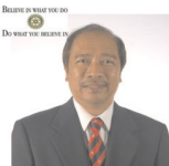
CP/PAG ZENN ZUZON RY 1992-94