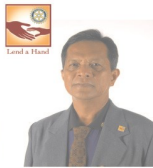
BOY OTANES RY 2003-04