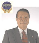
PAG NARDS TEVES RY 1995-96