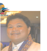
JUGGER LLIDO RY 2015-16