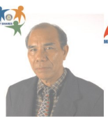
CARLING GANADOS RY 2007-08