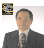
MAR YAP RY 2001-02