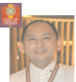
PAG ERICO UY RY 2014-15